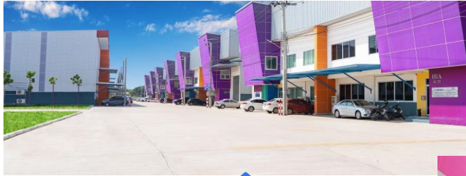
CHODTHANAWAT 2 BANGNA KM.16

“ Develop and Enhance to International Standard “