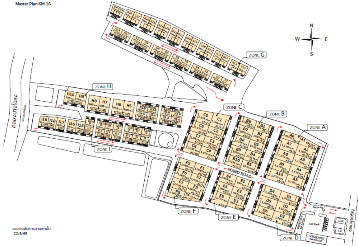
Factory&Warehouse Bangna Km.16 Master Plan KM.16