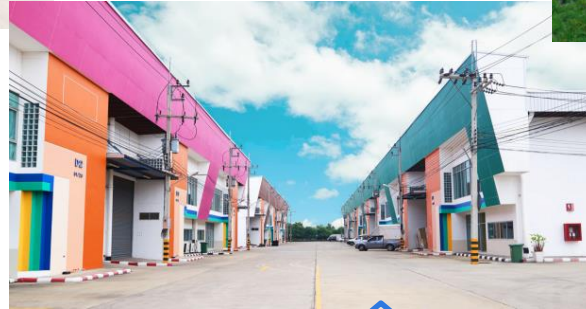
CHODTHANAWAT 3 RAMA 2