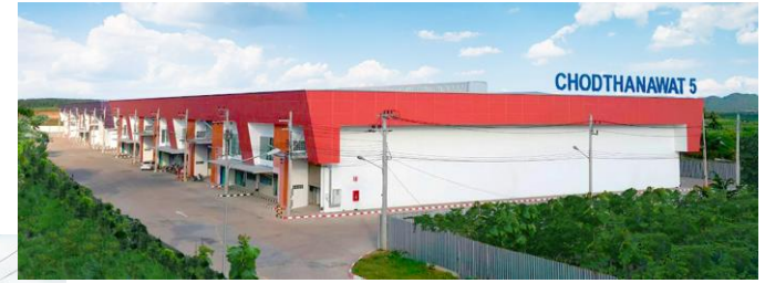
CHODTHANAWAT 5 CHONBURI - RAYONG