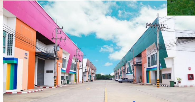
CHODTHANAWAT 3 RAMA 2