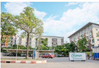
Chanyawat Apartment (140 m.)