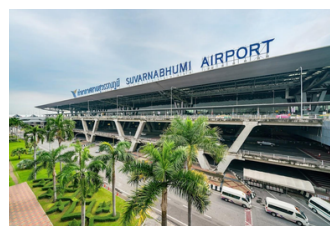
Suvarnabhumi Airport (19.3 k.m.)