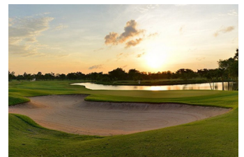
Green Valley Golf Club (9 k.m.)