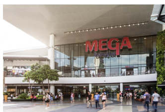
Mega Bangna (14.7 k.m.)