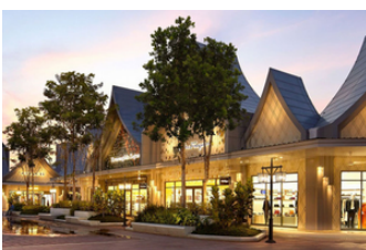
Central Village (11.2 k.m.)