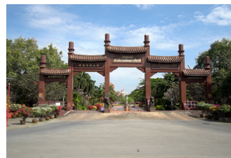
Hua Chiew University (2.3 k.m.)