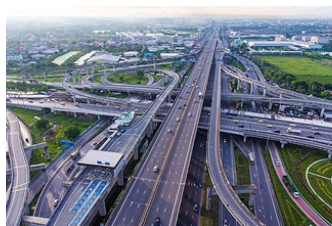
Buraphavithi Expressway (850 m.)